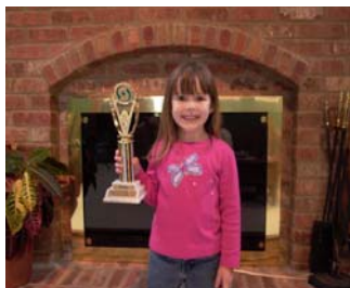
SuperSib Bailey is delighted with her personal courage trophy