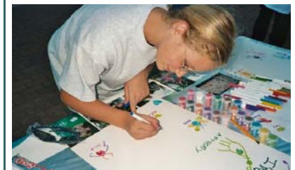
Sibling creating an "I'm Thumbbody" Poster at our SuperSibs! booth at "Light The Night" to help fight Leukemia and Lymphoma.