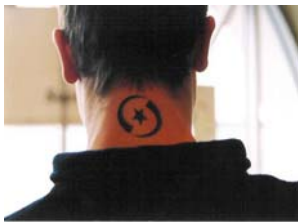
Teen sibs get creative with our SuperSibs! temporary tattoos at a cancer survivor conference in Madison, WI.